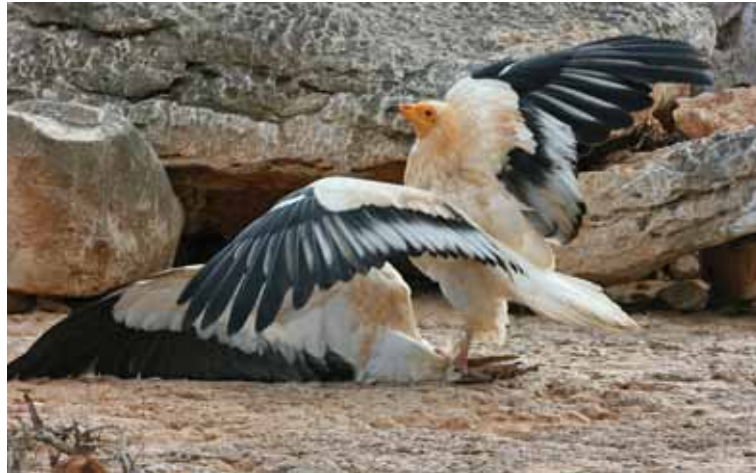
8. Possibly sensing threat, the 'dominant' bird raises itself from the ground by flapping its wings.

tried to liberate itself two or three times by flapping its wings, calling weakly, and during the interaction its bill was held open for most of the time (plate 6). At these attempts, the dominant bird would try to peck (but never actually touched) the other. Frequently, the two birds simply gazed around (plate 7). When we arrived, a third individual was perched on a nearby rock, but this bird flew away as we first drove closer to take photographs. Soon afterwards, as we approached closer still, the dominant bird raised itself from the ground by flapping its wings as if taking off (plate 8; we were unsure whether this was a result of our intrusion or part of the ritual). At this point, the submissive vulture was liberated and flew off (plate 9); the dominant one tried to catch it and