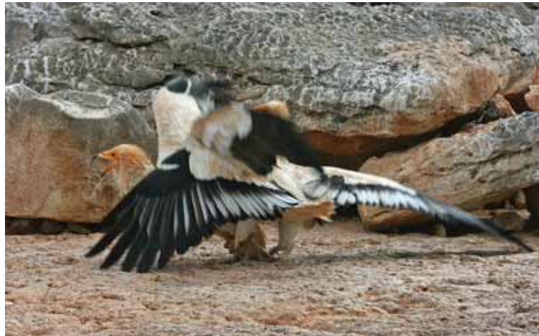
9. The 'submissive' bird manages to liberate itself.

managed to tear away several feathers from the nape with its bill. The chase continued and both vultures flew off along the wadi bed and disappeared. We were unable to tell the sex of the birds but both were full adults. The whole event lasted about 10 minutes.