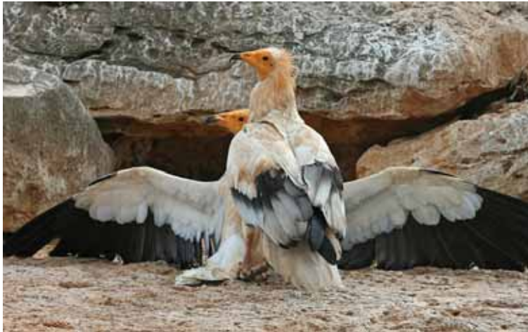
5. The 'submissive' vulture is found lying on its back with outstretched wings and legs pinned to the ground by the 'dominant' vulture.