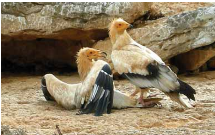
7. As if expecting something to appear from any direction, both vultures gaze around.

Socotrans call the Egyptian Vulture 'municipal bird'. The breeding distribution on the island is shown in fig. 1.