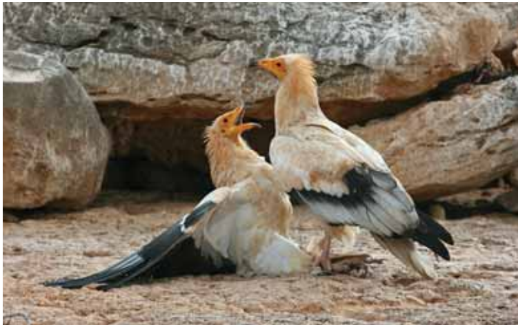
6. With its bill held open and calling weakly, the 'submissive' bird lamely tries to liberate itself.