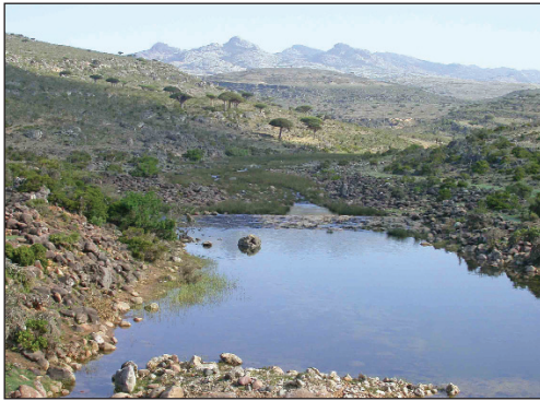
Plate 2 (left). Wadi Zirage, October 2008, Socotra.