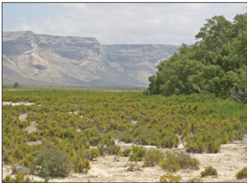
Plate 4 (left). Salt flats at Neet, February 2007, Socotra.