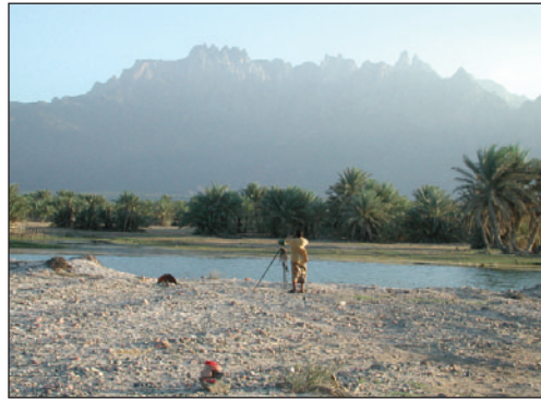
Plate 3 (right). Author at Sirhan lagoon, February 2004, Socotra.