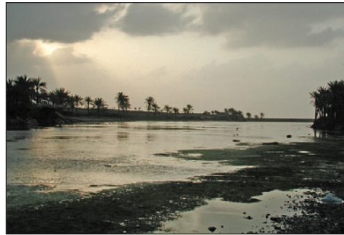
Plate 1. Qalansiya estuary, February 2006, Socotra.

Birds have been recorded during surveys at potentially suitable nesting areas: at Qalansiya estuary, Wadis Sheq and Sirhan (at Hadibu), Mateaf lagoon (SE Socotra), Qariyeh lagoon (N Socotra) and Wadi Zirage in the central highlands (Plate 2). The first indications of breeding behaviour were noticed on 23 February 2006 at Sirhan lagoon (Plate 3), close to Hadibu, where four pairs were engaged in territorial disputes.