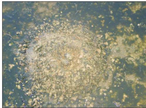
Plate 5 (right). Black-winged Stilt nest with two eggs, in stagnant pool, Neet, May 2007, Socotra.

On 22 February 2007, RF Porter, Paul Scholte and I visited the coastal plain at Neet, SW Socotra, some 4 km long and 500 m wide and consisting of a series of low-lying areas that fill with seawater during the monsoon season (May–August), but then dry out (Plate 4). It is important for salt production. Here we observed several old, raised, mud nests on the dried out salt flats. From the description of the birds given to us by the local villagers, these were the nests of Black-winged Stilts. They told us the birds had nested during the summer monsoon. I revisited the site 28–30 May with Tabet Abdulah of SCDP. Whereas we have regularly visited this coastal area, this was the first visit during the monsoon season, when travelling by boat is impossible due to extreme wind speeds. On 29 May, 11 nests on slightly elevated clay mounds covered by dried algae, were found in the stagnant pools (Plate 5). The tops of the mounds were covered with small stones and dead mangrove leaves and twigs. Two nests contained two eggs. From the number of adults present we estimated that the number of breeding pairs was over 30.